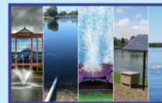
Aeration And Lake Conservation Project