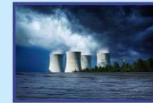
100% elimination of CT Blowdown Water