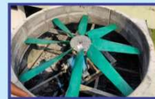
Cooling Tower & Humidification FRP Fan