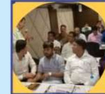
Training Program & workshop