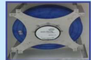
40% Reduction in AHU Energy