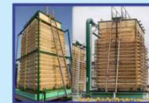
FANLESS COOLING TOWER