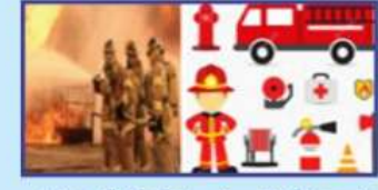
Fire & Safety Audit Services