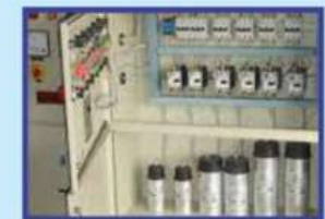
APFC SMART CONTROL PANEL